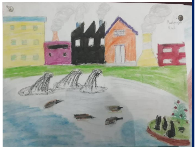
Pushpanjali – 4MT