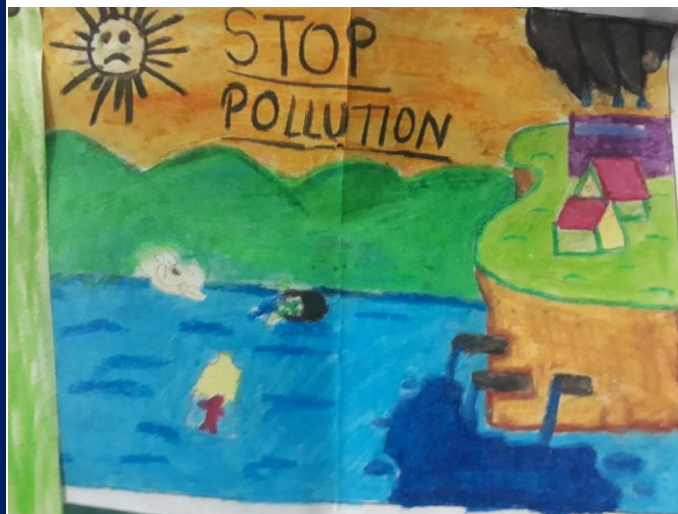
Shristi Gautam – 3 CVR