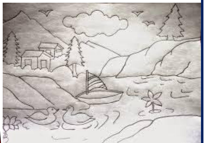
Shivika – 2 CVR