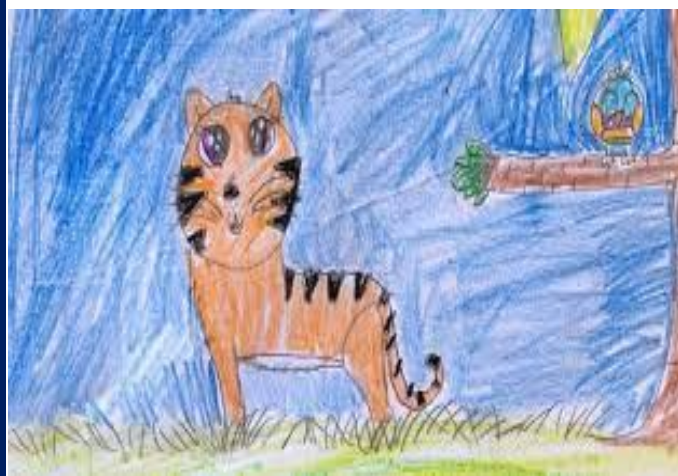
Arya Vats – 3 CVR