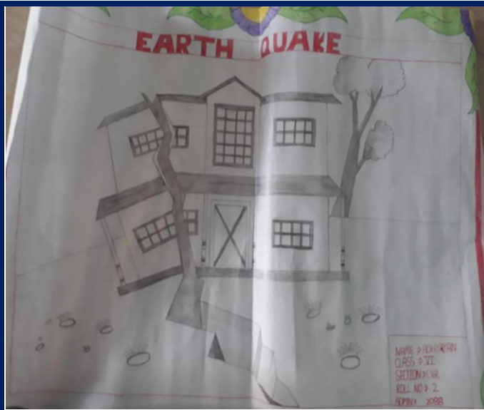
Adhiryan – 6 CVR