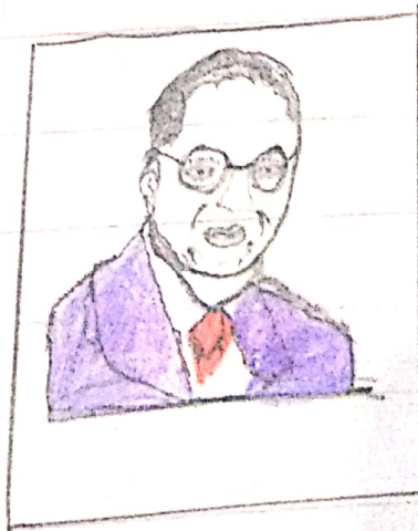
Dr. B.R. Ambedkar

After India's independence on 15 August 1947, he became the first law minister of India. He was appointed as the chairman of the constitution Drafting Committee. He is recognised as father of Indian constitution. B.R. Ambedkar was undoubtedly the most suitable person for this job. He had vast knowledge about the constitution. He studied constitution of 60 countries.